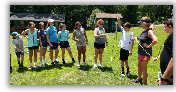
BUILD LASTING FRIENDSHIPS WITH LIKE-MINDED FRIENDS